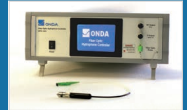
HFO-690 Fiber Optic Hydrophone System