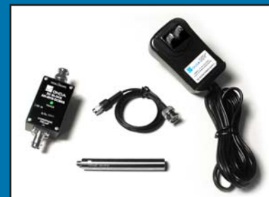
Amplifier is supplied in a kit with Universal Power Supply, DC Block, 1m coaxial cable and calibration certificate.