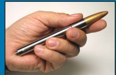
AG-2010 preamplifier with HGL-0200 hydrophone