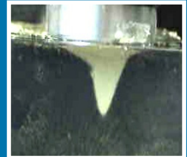
Visualize transducer performance in 3D