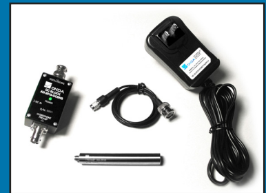
Amplifier is supplied in a kit with Universal Power Supply, DC Block, 1m coaxial cable and calibration certificate.