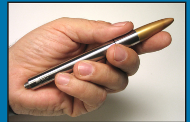
AH-2010 preamp with HGL hydrophone